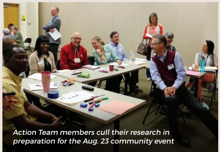
Action Team members call their research in preparation for the Aug. 23 community event